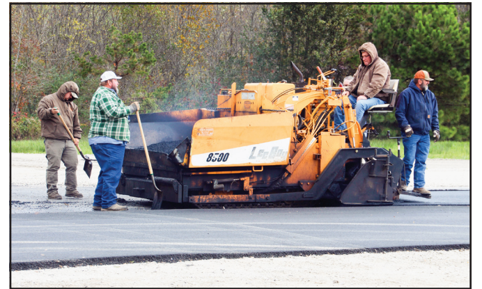
Workers finishing up new paving on the commercial side of the Transfer Station late last month. All renovations have been completed, with the county now waiting to secure landfill hauling before it can re-open the facility.

Commercial dumping has been closed to the public since Oct. 4 for safety renovations and a transition of operations to the county from out-of-contract Waste Management, which See Transfer Station, Page 2A