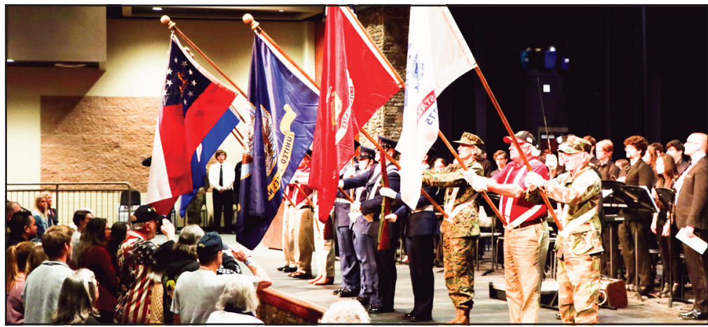
Veterans with The American Legion Post 121 demonstrating the various U.S. service flags in the Nov. 11 school Veterans Day service, which was moved from Mike Colwell Stadium to the Fine Arts Center due to weather concerns.