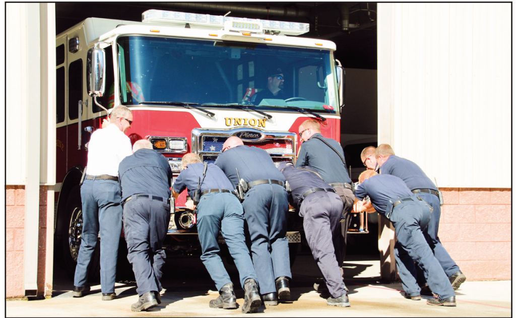
UCFD Station 1 Firefighters teamed up to push their brand-new 33,000-pound Engine 1 into the bay at headquarters Nov. 9.

Station 13 will be built See New Engine, Page 3A