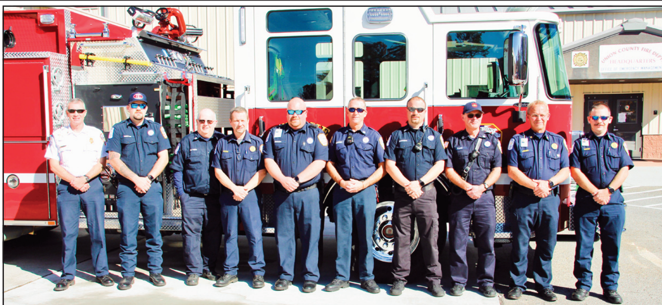
The new fire engine features several important upgrades, including added safety for firefighters, extra cab space, greater maneuverability, more horsepower, and an American Flag-painted grill.

"The best thing to happen to the county is having SPLOST funds to be able to do important things for public safety," Sole