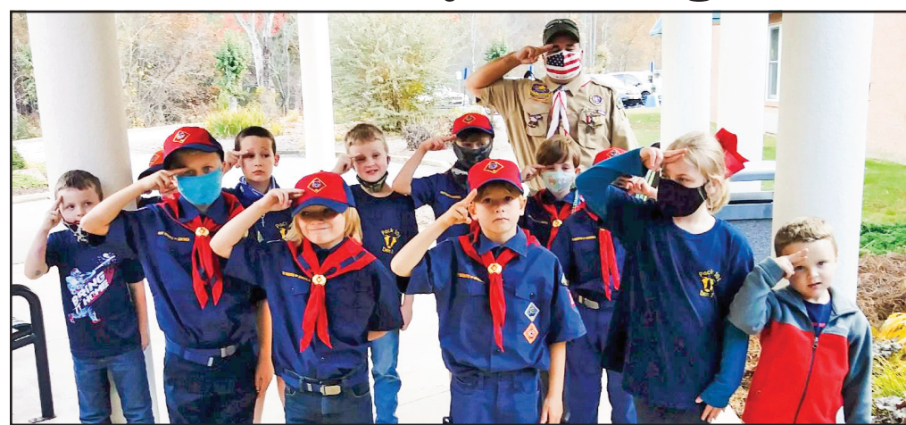
Wolf Scouts Pack 101 Cub Scouts brought each Veteran a homemade "Care Package"

Veterans Day began at 9 AM for the residents living at Union County Nursing Home when the Mountain Area Support Alliance dropped of "goodie bags" for the 15 Veterans currently living there. A United States Flag and a bag of homemade cookies were among the treats put together for this special group.